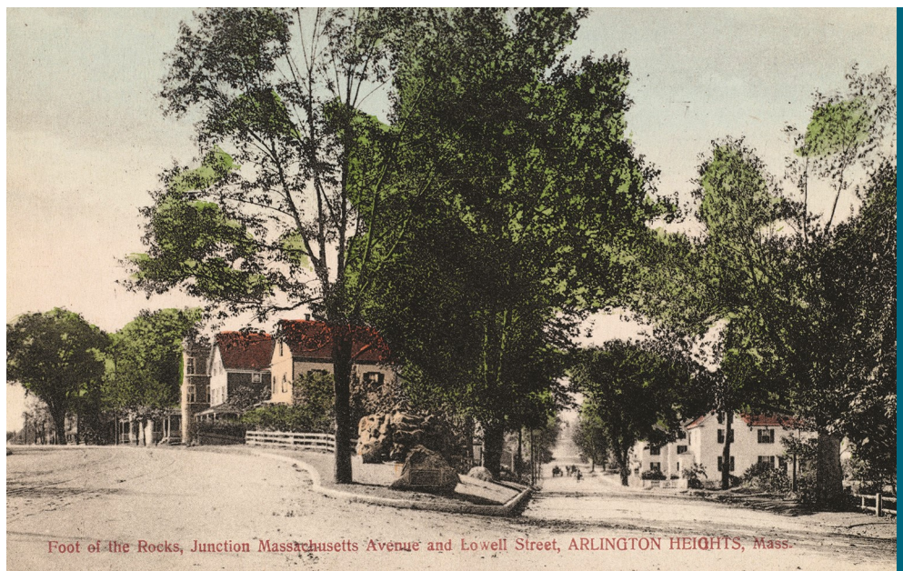
Located at the junction of Massachusetts Avenue and Lowell Street, the sliver of a public park has honored the fighting between British soldiers and American colonials in the area known as the "Foot of the Rocks." The site is currently being studied to enhance its visibility in relating events of April 19, 1775. Circa 1915 postcard.