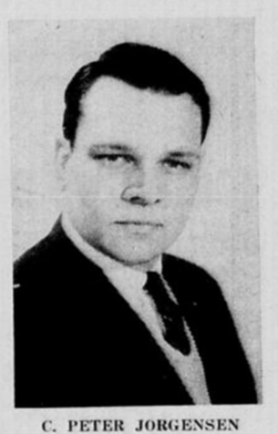
Star employees are being retain-

Announcement in the Winchester Star, May 13, 1971