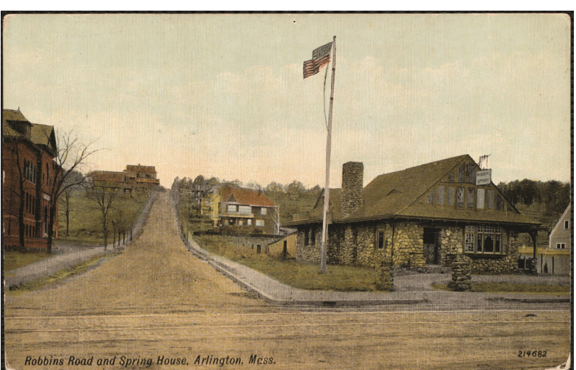
The Robbins Spring House, built in 1894 on Robbins Road and Massachusetts Avenue was the headquarters for a bottled water company at the time of this article, which notes that it is "a popular bicycle stopping-place where spring water and other refreshments may be obtained."

rocky tip well shaded, but sufficiently open to disclose a wide prospect of town and country below. At the left lies Arlington in its fine setting; in front are fair fields, woodlands, hills, and vales, and beyond the outlines of distant mountain tops; at the right, stretches of woods, here and there broken by pastures and well-tilled farms. It is a less extensive view than that from the loftier Arlington Heights, but more diversified. The hill is used by the Signal Service. It is called Turkey Hill from the